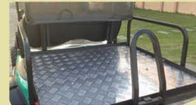
Rear flip seat with diamond plated aluminum and 350 lb payload capacity