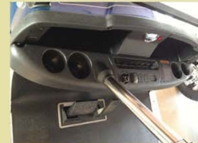
Deluxe dash system with speedometer, odometer and state of the art charge meter