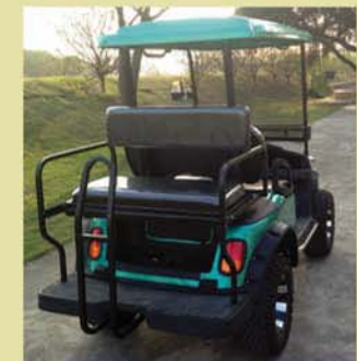
Rear LED lights; color matched roof stylish 12" machined aluminum wheels; seat belts and more

*Specs are subject to change without notification Created 2/2014