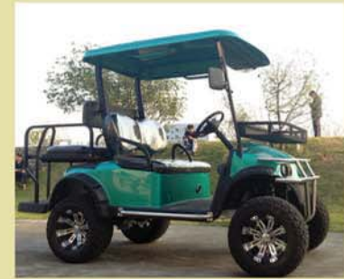
Fully loaded with stainless brush nerf bar and clay basket comes standard

4 passengers 8x6V, Trojan T 105 6 HP Continuous; 22 Peak HP 275 Amp AC Curtis 19.5 MPH (29-25 MPH if LSV) 900 lbs 112"Lx47"Wx79"H 1546 lbs 7" 11ft 68" 30% Plastic Independent A-arm with coil over shocks Leaf spring and shock Rack and pinion Four wheel hydraulic disc with electronic walk away function 23 x 10.5 x 12 CST Tires 20 PSI 12" Machined wheel Foldable with safety catch bar Plastic, color matched Direct rear drive with 16:1 ratio 20A 48V to 12V included One piece Lexan Included Included Included Included Included Included Included Included Included Included Included Included Included Optional Included Limited 4-Year warranty 2 year bumper to bumper less wear items